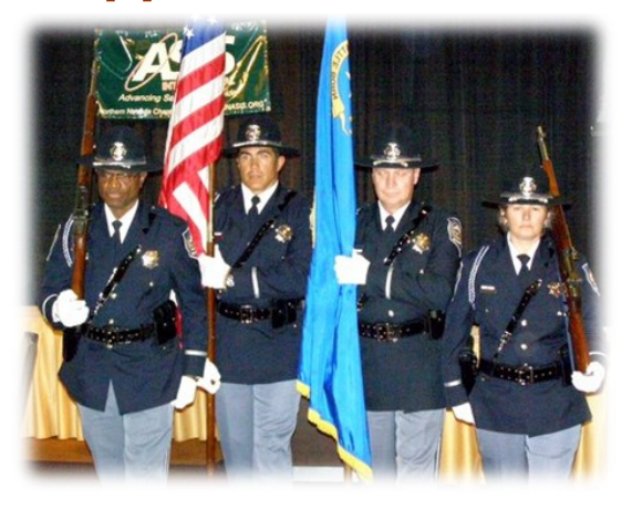
Nevada Department of Public Safety Color Guard